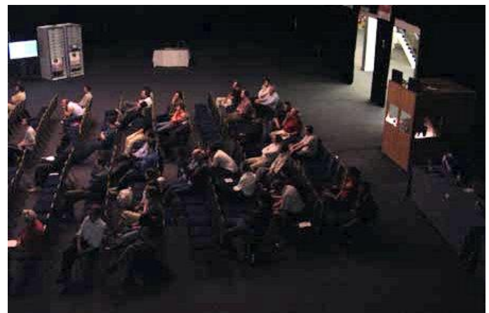
The spectators gasp.