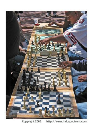
Summer time is busy for chess on Market.