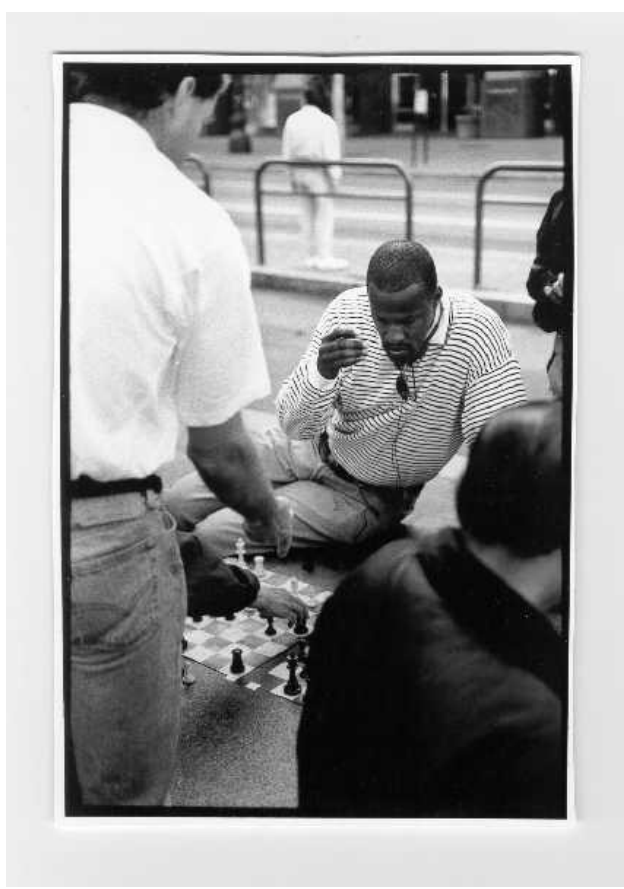
This is a homeless guy who is expert strength.