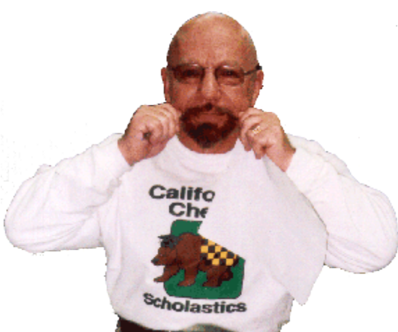
Hamming it up for his cronies