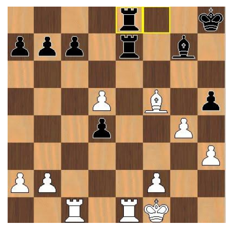
White to move and win!